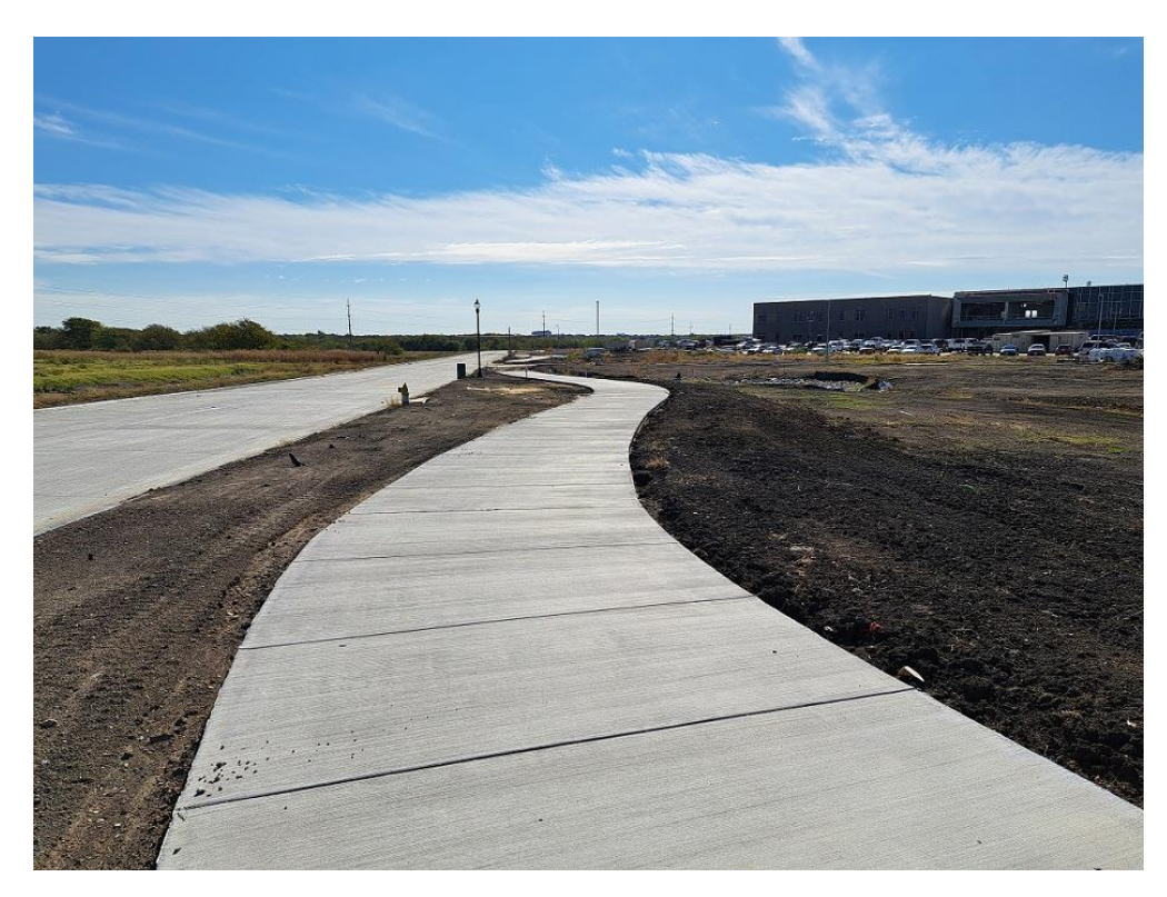
Denton Middle School