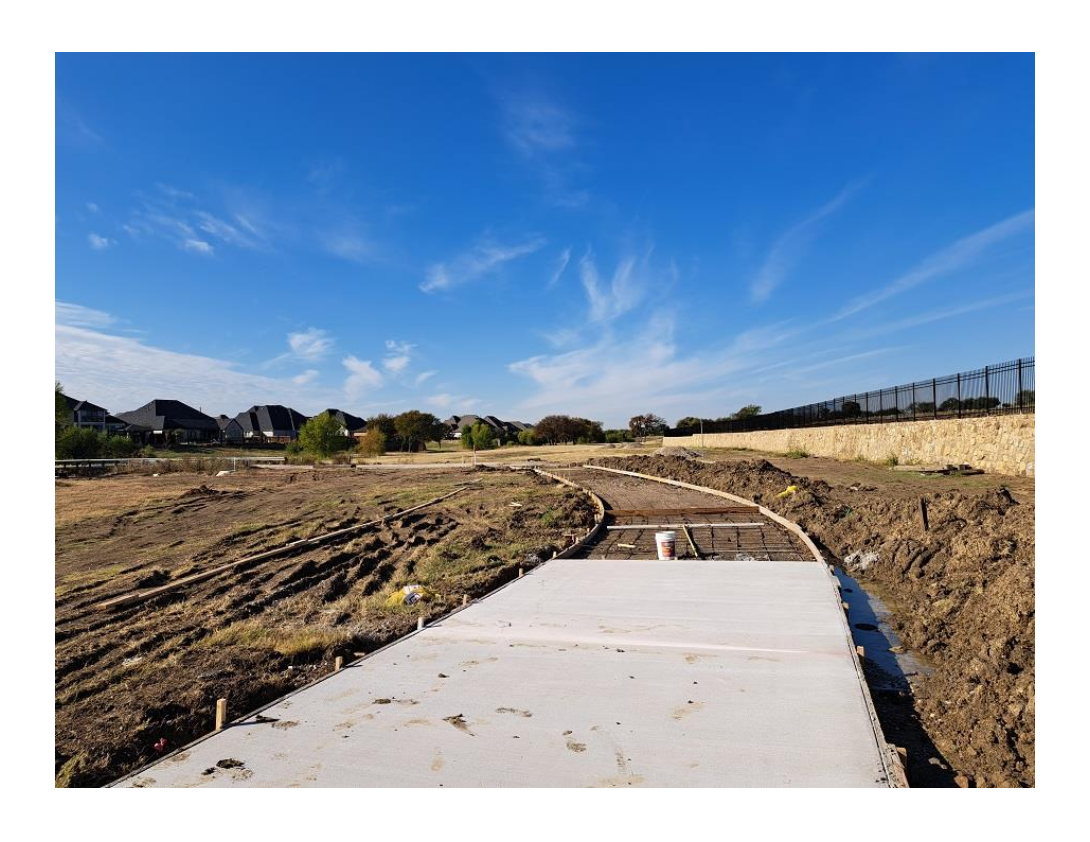
Tanners Mill Park