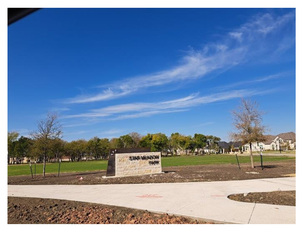
Star Meadow Park